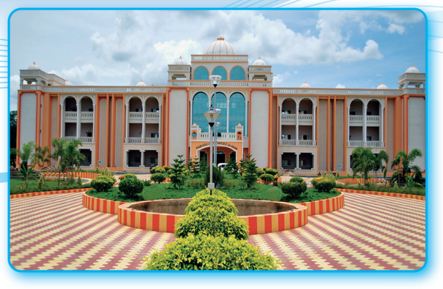
University Administrative Block