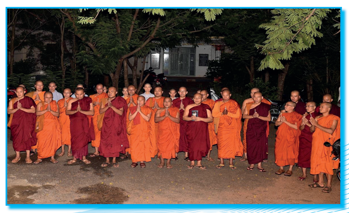
Prayer Chanting by Buddhist Monks