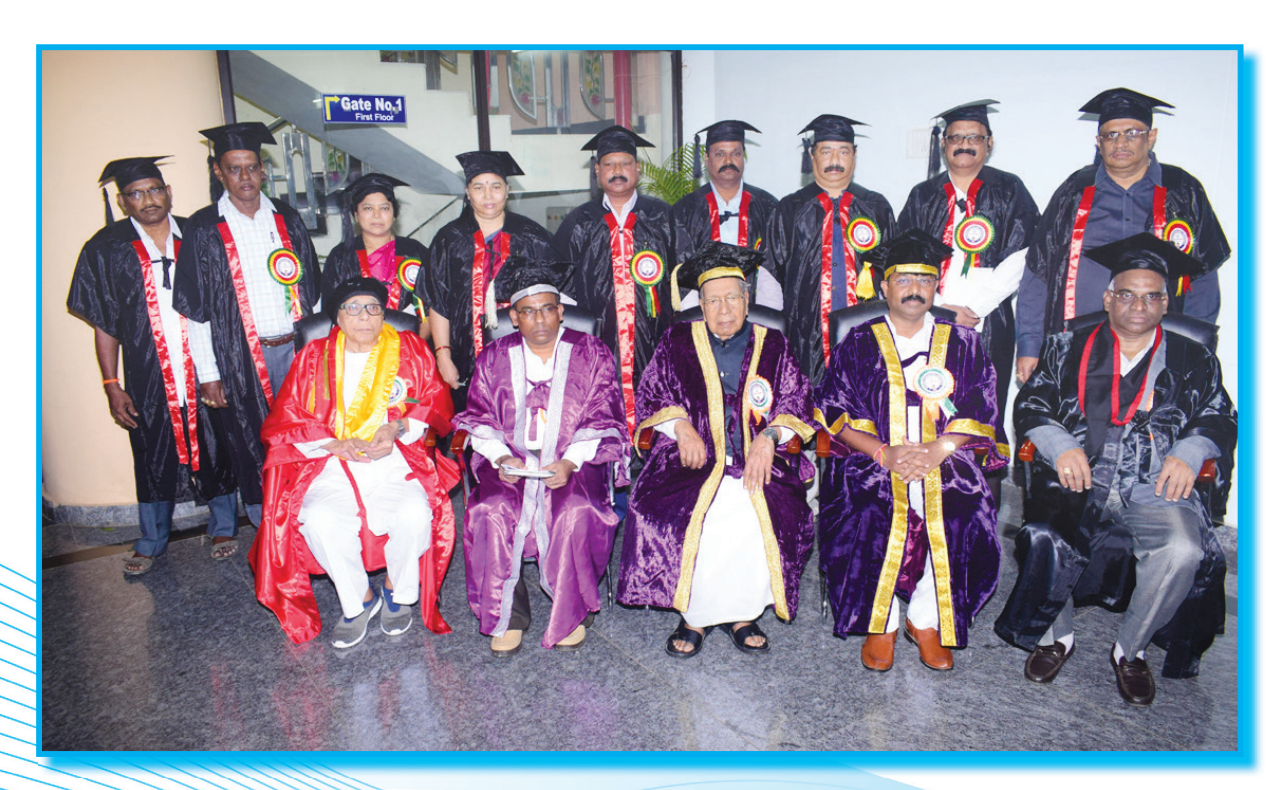
Group Photo on the Occasion of XXXV & XXXVI Convocation