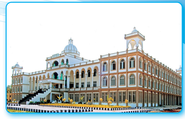
Centre for Distance Education(CDE) Block