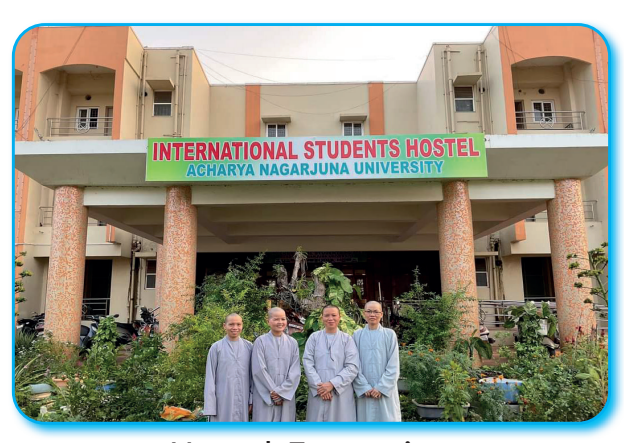
Hostel Front view