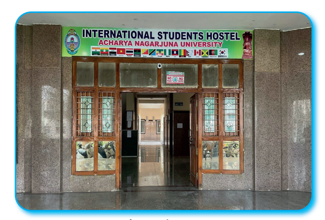
Hostel Main Entrance